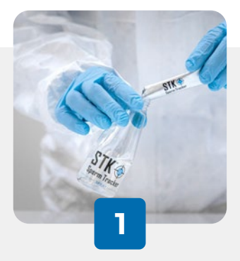
Dilute 1 pouch of STK Spray in 100 ml (~3 US fl oz) of demineralized water

Formulated in a convenient format, dry powder is simply dissolved in water, the product is rapidly ready-to-spray and easy to carry.