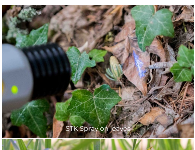
STK Spray on grass